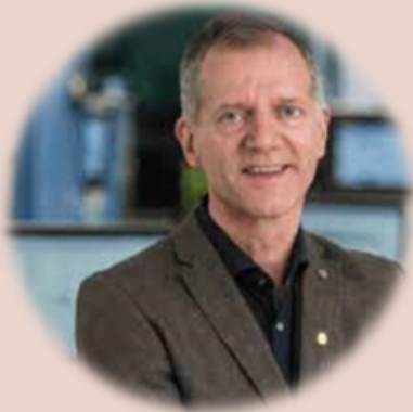
Matthias Mann, Ph.D. Max-Planck Institute of Biochemistry Munich, Germany